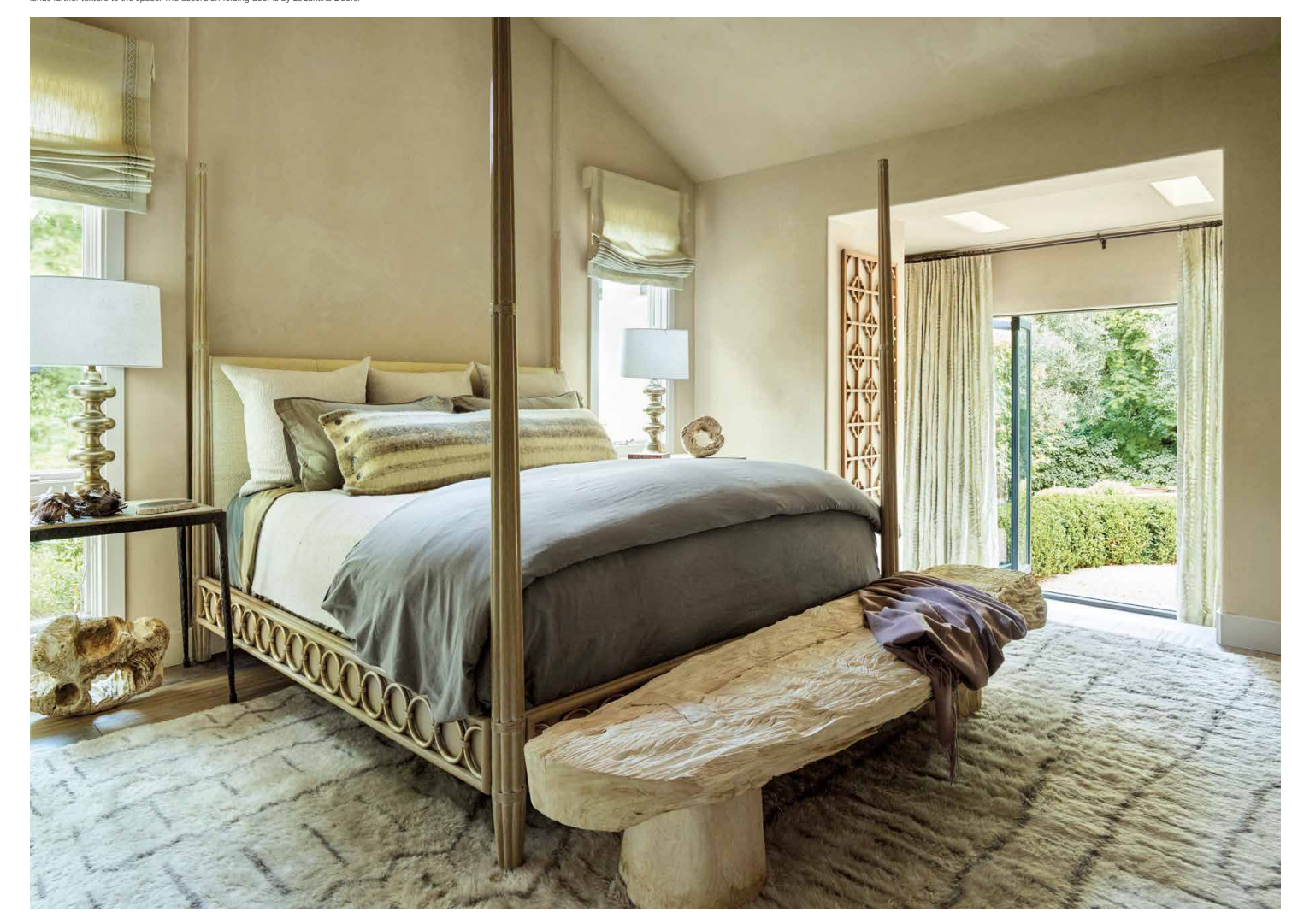
The owners' McGuire four-poster bed, accented with a lumbar pillow by Cade Home, and Moroccan rug act as focal points in the light-filled master bedroom. A rustic wood bench from SummerHouse lends further texture to the space. The accordion-folding door is by LaCantina Doors.