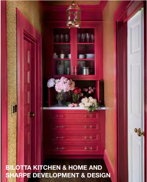
PHOTOGRAPH BY: (OPPOSITE TOP) BRIAN MADDEN, DESIGNED BY ROBERTO LEIRA, ARCHITECTURE BY JOHN TERZ; (OPPOSITE BOTTOM) LESLEY UNRUH, COLLABORATION BETWEEN BILOTTA KITCHEN & HOME AND SHARPE DEVELOPMENT & DESIGN

“OLIVE GREEN, CHARCOAL GRAYS, NAVY BLUES, AND EVEN DEEP PURPLE ARE BEING USED. OFTEN THIS IS MIXED WITH DARKER COLORS ON THE LOWER CABINETS AND LIGHTER COLORS ON THE UPpers. DARK HANDSOME COLORS JUXTAPOSED TO BLEACHED AND LIGHT WOODS ARE VERY POPULAR.” —Christopher Peacock