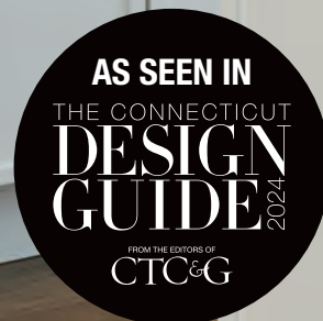
PHOTOGRAPH BY HULYA KOLABAS FROM CTC&G OCTOBER 2022 "SIGHT LINES"