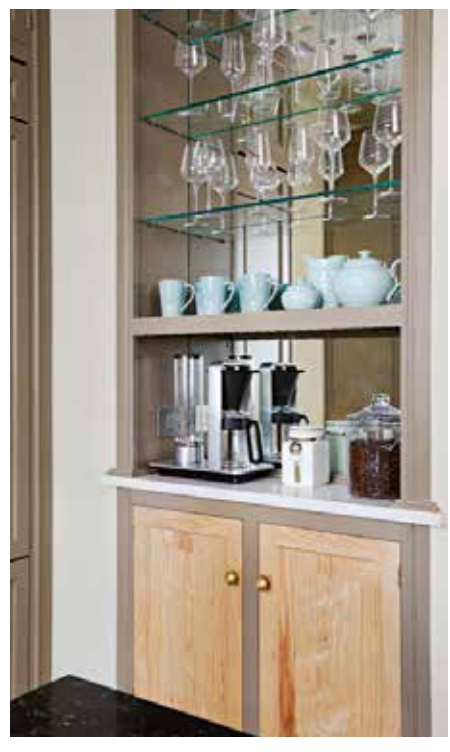
Range wall A Jenn-Air range and brass-trimmed hood tuck into a niche lined with Caesarstone's "Calacatta Nuvo" quartz. Period-appropriate "Manoir Gray" French oak floors are from Exquisite Surfaces. Coffee bar A mix of painted and stained finishes gives the cabinet furniture styling.