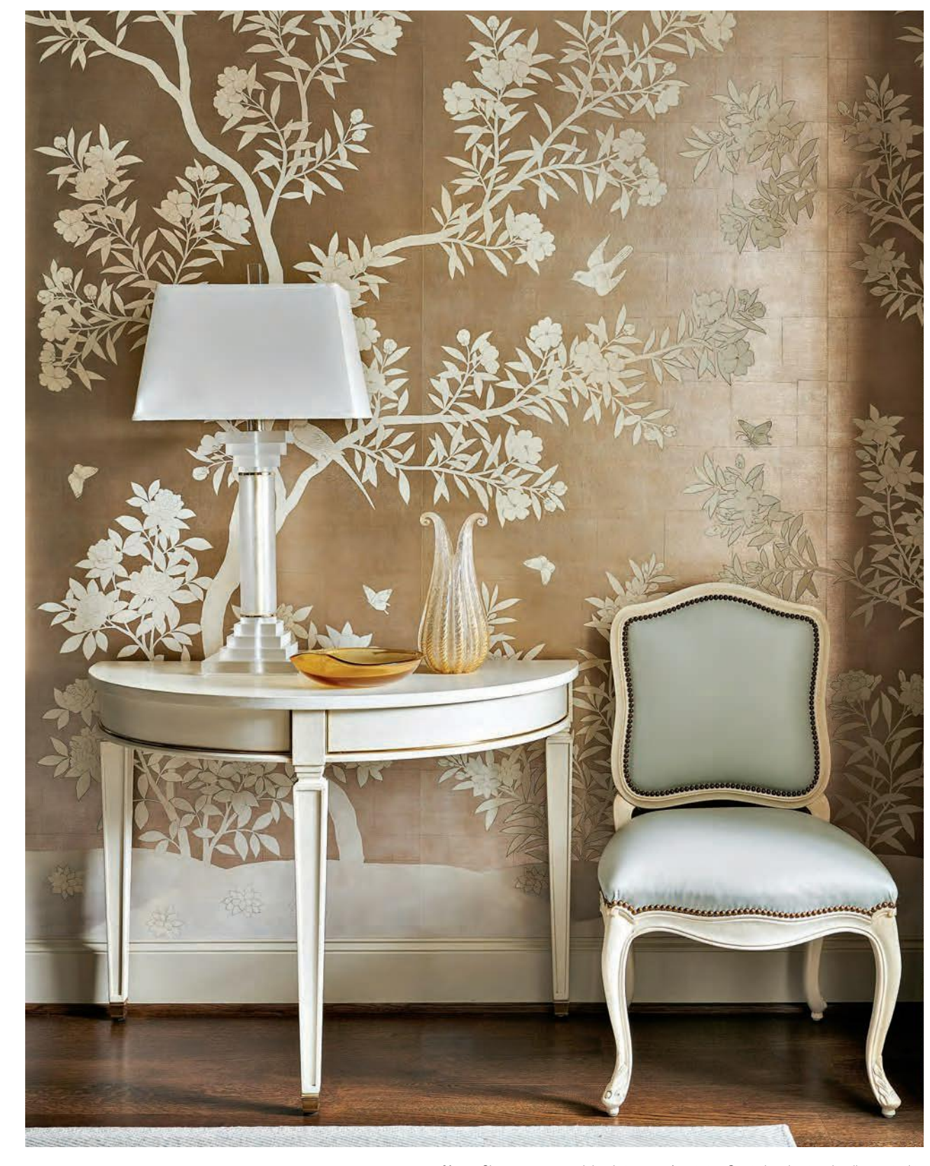
Above: Showers preserved the dining room's existing Gracie hand-painted wallpaper in this to-the-studs renovation. The Marnie dining chair and Sebastien demilune table—which holds a vintage stacked Lucite lamp—are from the Jan Showers Collection.

Opposite: A 1920s antique French Baccarat crystal chandelier illuminates the brass-embellished Zara dining table from the Jan Showers Collection. Kravet's Barnsdale pattern in Cloud covers the backs of the Marnie dining chairs. The blue Marbro Murano glass lamp is vintage.