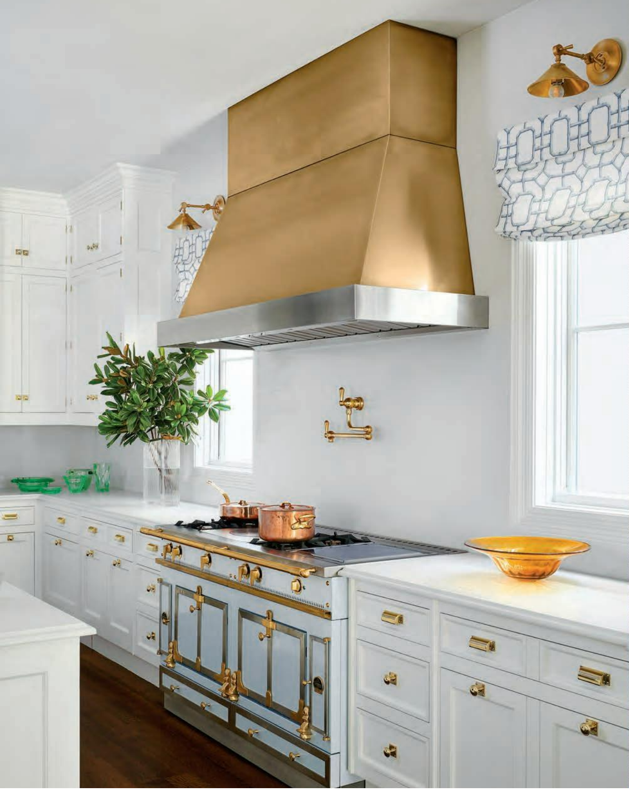
Above: The La Cornue range's custom blue hue pops against the Christopher Peacock kitchen cabinetry. Marble selected by J+L Design Studio for the backsplash and counters is from Allied Stone. A custom Modern-Aire Ventilating hood complements the Christopher Peacock brass cabinetry hardware and The Urban Electric Co.'s Maxine sconces.